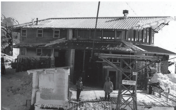
A little piece of history - can you guess?

The Lodge Captain (after notifying the Accommodation Director of the Club) is empowered to take any necessary action to ensure the proper running of the Lodge. Please review the duties on our website.