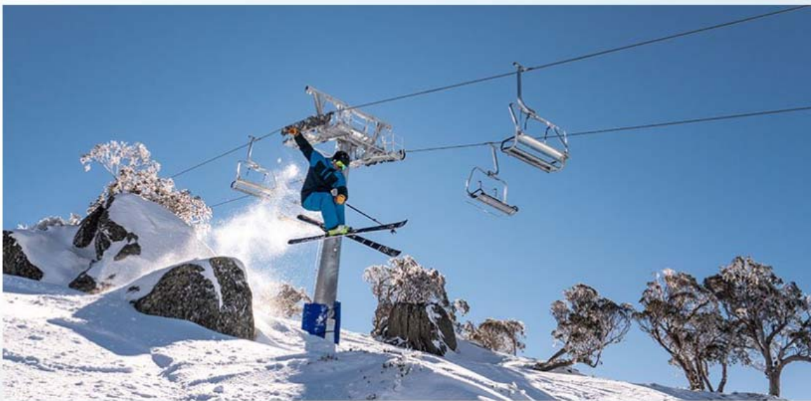
New Leichhardt Quad Chairlift - Ready For Opening - 05 June 2019

Big news at Perisher is the opening of the new $4.2million dollar Leichhardt quad chair on the 5 th June.