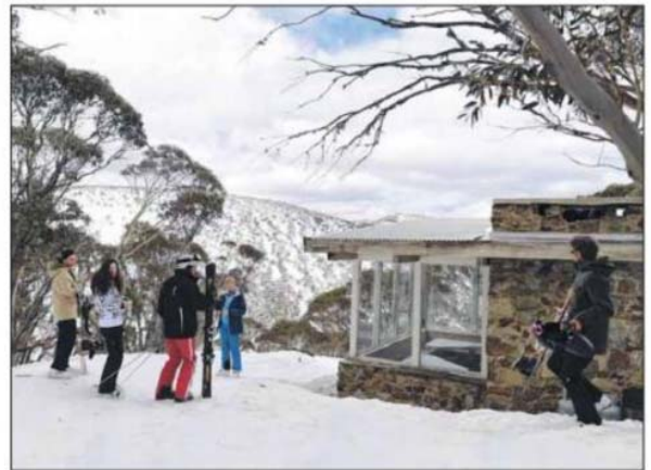
STONE HUT: The Joyce Brockhoff Hut has been revamped into a food and drink destination, perched in the action of the Hotham slopes.

Alpine Nature Experience's team invites you to a cheese feast like no other! Grill a half wheel of French cheese and scrape the melted goodness on baked potatoes, all accompanied by delicious charcuterie, smoked meats and a selection of wine and craft beer. Held in the heated tipi at Alpine Nature Experience's ecovillage and includes a guided snowshoe tour.