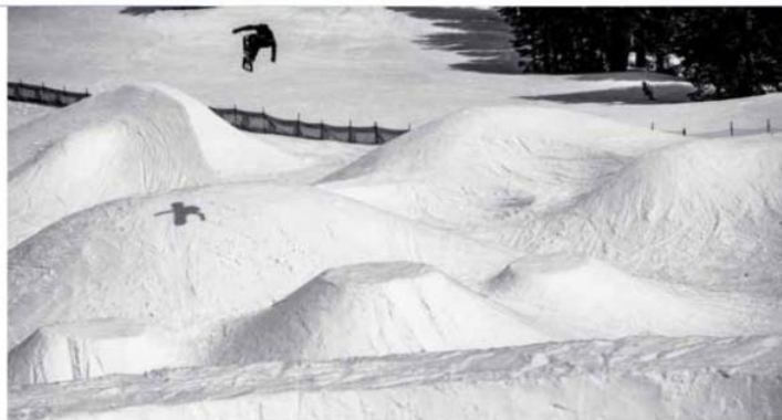
rider Blair Habenicht at Sunshine Village - 2017