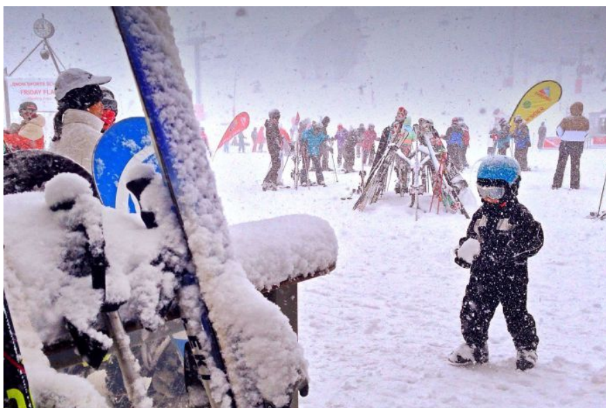
Season 1996 ended up a big one after no snow for most of June.

In 1996 there was zero natural snow on the ground as late as June 25 but it ended up as a massive season with a peak depth of 254.2cm taken on October 3rd. On the other side of the ledger 1998 had zero snow on June 4 and only struggled to a paltry peak depth of 138.2cm on August 23.