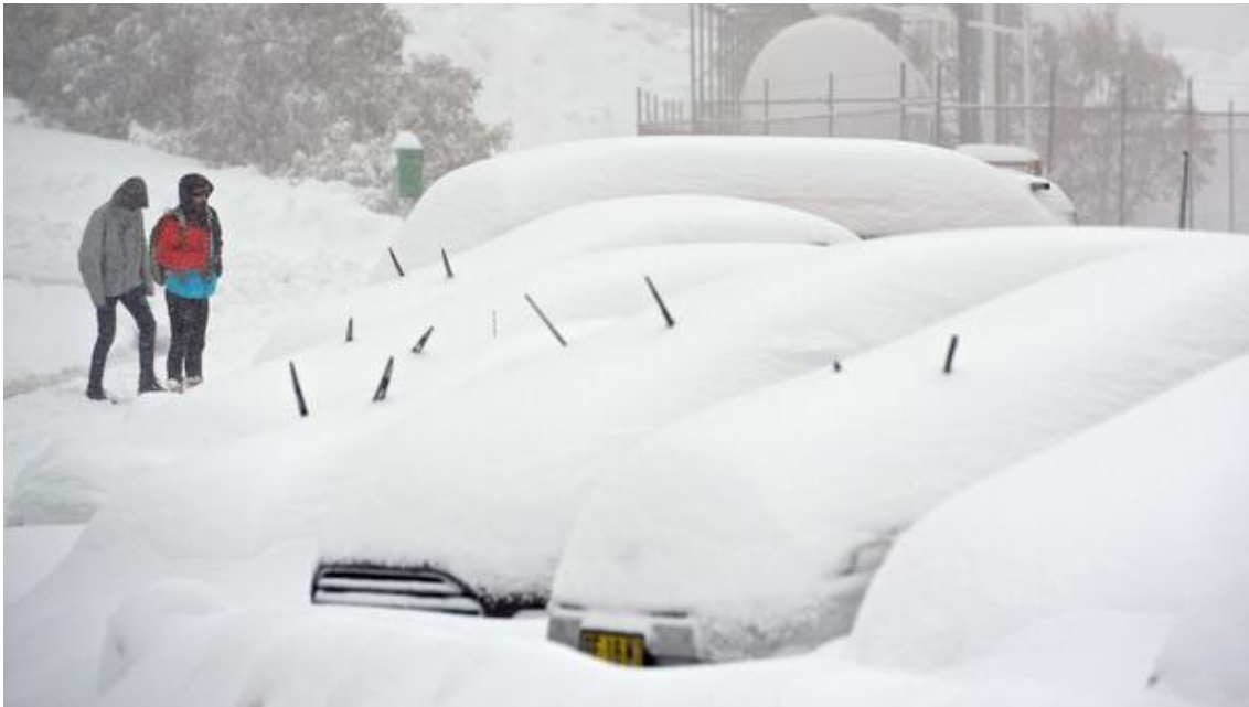
Falls Creek 2014, the last time we didn't have natural snow to start the season.

If we were to take an average from these 11 years that the snow season struggled to get off the ground then we would come up with around 161cm and the peak would be in the third week of August. Over the last ten years or so snowmaking has papered over the fact that early June is usually sketchy. With a couple of good weeks of cold nights leading up to opening weekend the resorts can be top to bottom.